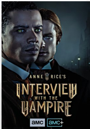
Interview with a