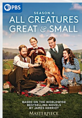
All Creatures Great & Small